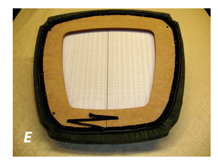
Staple excess cord to Seat board

Cinch Loc is available in festooned boxes of 2000 yds or single spools of 300 yds.