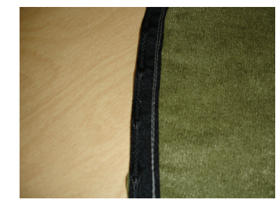
Attachment by sewing superior to stapling

Cinch Loc is normally made in black at 20 mm wide. Other colors and sizes may be available.