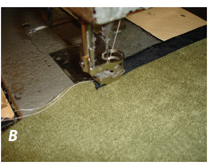
Sew Cinch Loc to fabric