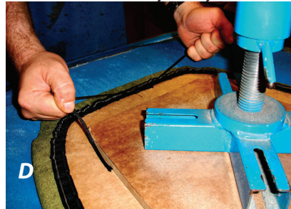
Compress Foam and pull cord