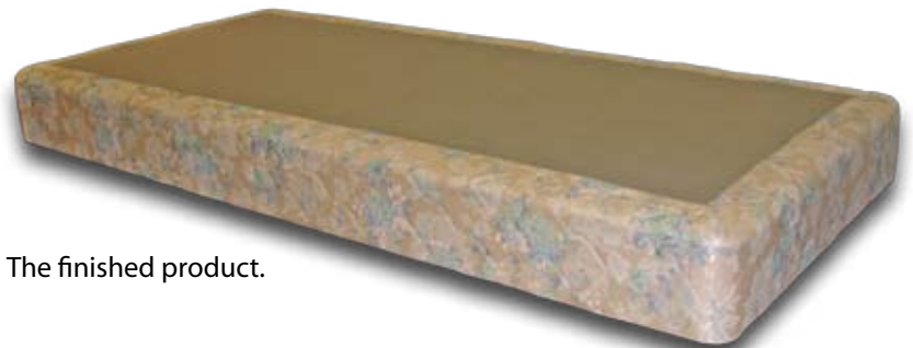
The finished product.

911 Northridge Street • Greensboro, NC 27403 Phone: 336-379-7777 • Fax: 336-379-7774