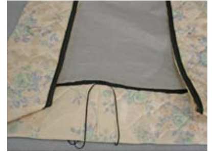
2. Completion of Cinch-Loc™ sewn to border. Assembly ready.