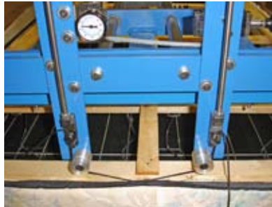
3. Compress Box Spring with assembly and pull cord.