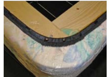
6. Attachment by sewing - superior to stapling.