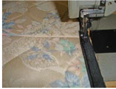
1. Cinch-Loc™ is sewn to the border.

Cinch-Loc™ is a simple, easy method to apply covers to Box Springs. It is a textile tape that encapsulates a draw cord. The product is sewn to the perimeter of the border and the cord is pulled and attached while the Box Spring is held secure. Bedding Manufacturers are discovering the simplicity of Cinch-Loc™ . We invite you to join with them in this discovery of new and better efficiencies for your Box Spring Cover applications.