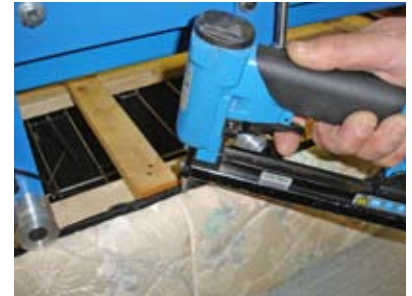
4. Cinch-Loc™ pull cord is stapled to the frame